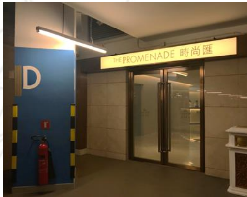
Lift Entrance at Area D