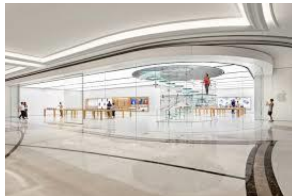
Signage next to Apple Store